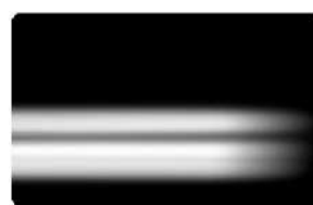
STB-4F1 HIGHGLOSSBLACK RAL 9005