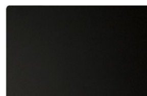
STB-425 ULTRAMATTBLACK RAL 9005