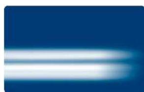
STB-4A2 HIGH GLOSSBLUE RAL 5005